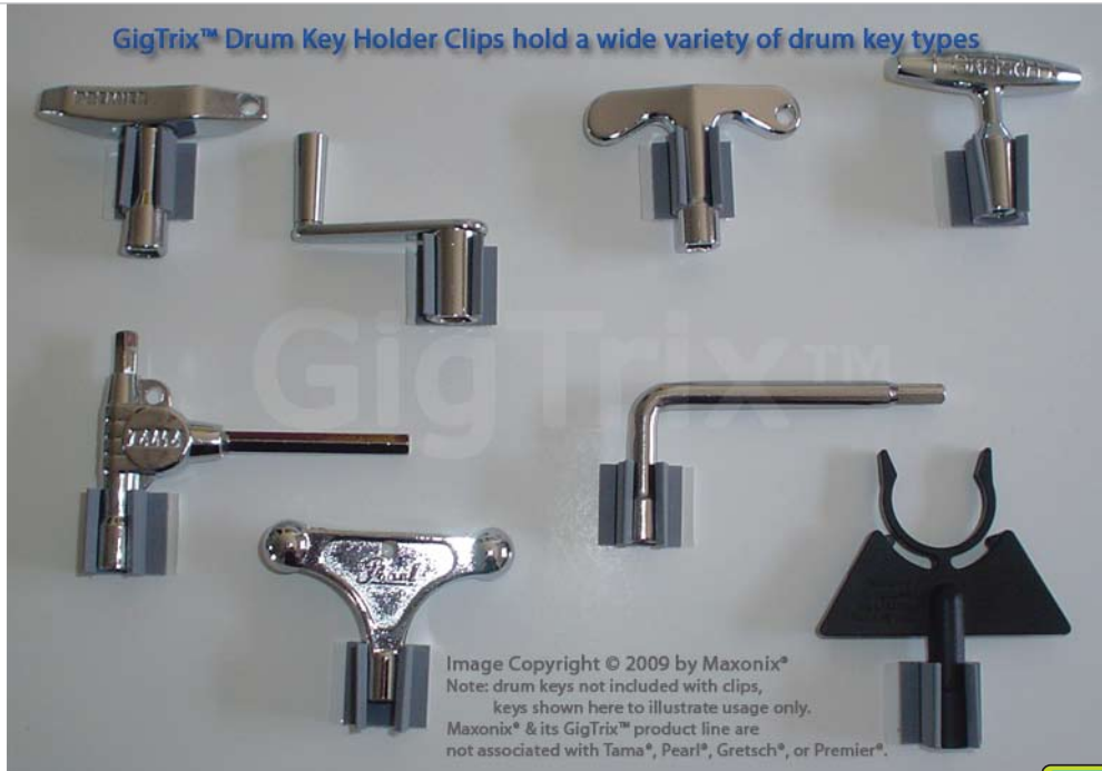
GigTrix™ Drum Key Holder Clips hold a wide variety of drum key types

Note: drum keys not included with clips, keys shown here to illustrate usage only. Maxonix® & its GigTrix™ product line are not associated with Tama®, Pearl®, Gretsch®, or Premier®.